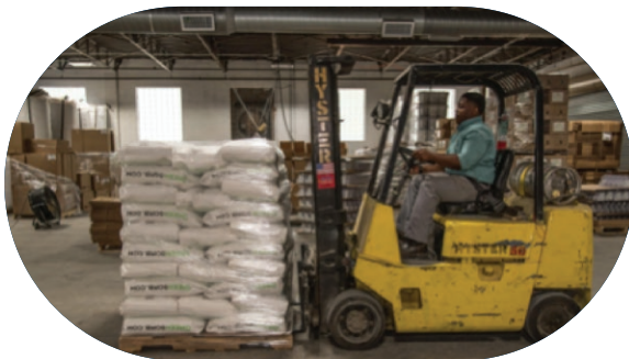
The warehouse at Advance Memphis, where participants receive job-training in forklift operation and other logistics tasks.

Upon entry in their job-training program (“Work Life”), most enrollees report no labor market income (although many receive government benefits) and most are unemployed. This year, the average wage paid to Advance Memphis graduates is $10 per hour, which is nearly a living wage in Memphis.