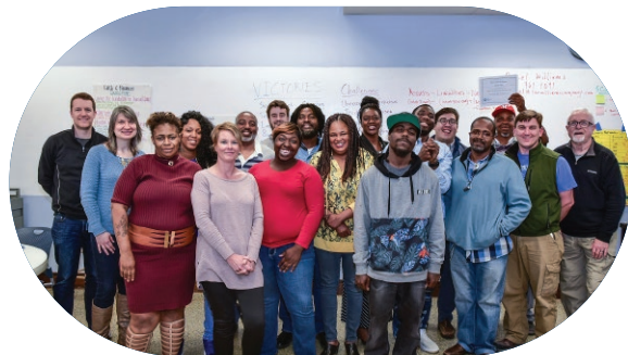
A recent group of graduates from the Faith and Finances financial literacy class, with members of Advance Memphis’s staff and mentors.