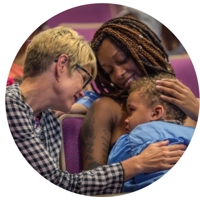
Mothers and their children in the program attend a graduation ceremony with their nurses.